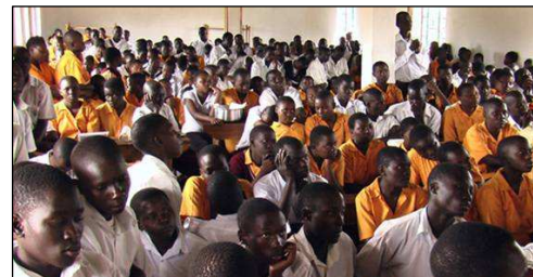
▲ A school assembly at St Janan's.

The school has recently launched the first in a series of income-generating activities to further promote its financial independence. The school has purchased a new minibus to provide a vital mode of transport for school activities, and when not in use by the school the bus will be rented for commercial use providing a valuable source of alternative income for the school. PEAS has also funded a dance troupe, many of who are students at St. Janan's. The group generates significant revenues for PEAS from performances given at events throughout Kampala.