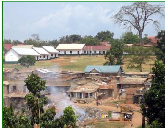
◀ St. Janan Luwum Secondary School, Kampala. The school overlooks part of the community it serves