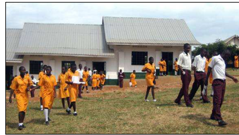
▲ St Janan's students moving to lessons.