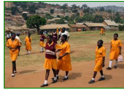
▲ Students from the first PEAS school.

'To unlock the potential of Africa by delivering equal access to affordable, quality education.'